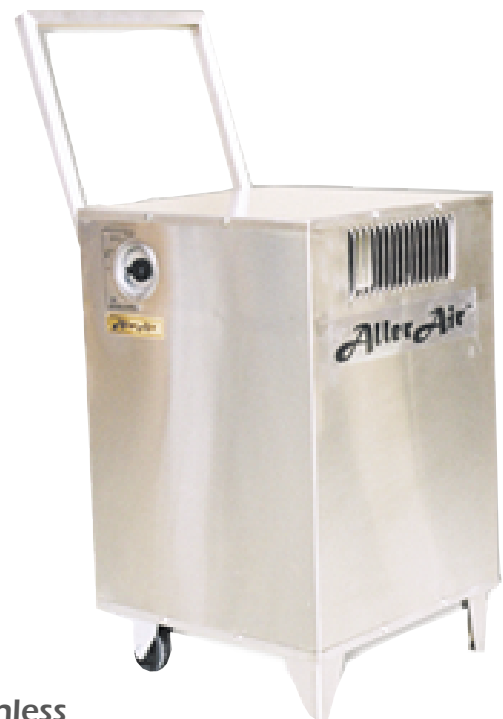
5000 D Stainless 24" x 15" x 15" - 45lbs

Same clean-ability as hospital and kitchen equipment